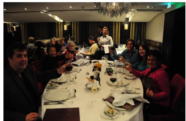
Dinner in the ship's dining room

Travel Protection: Please ask your Travel Advisor about your protection options or contact your local provider.