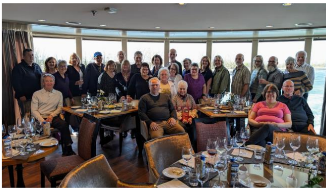
The 2024 Rhine River cruise group at one of our private tastings