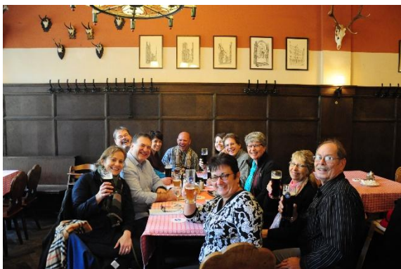
Visiting a local restaurant at a port