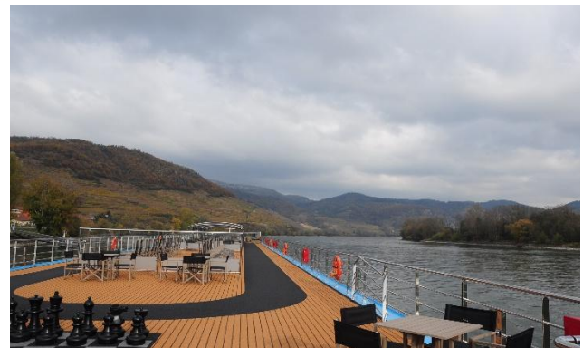
The view of the Danube from the deck